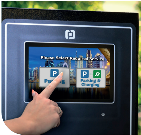
High definition touch screen