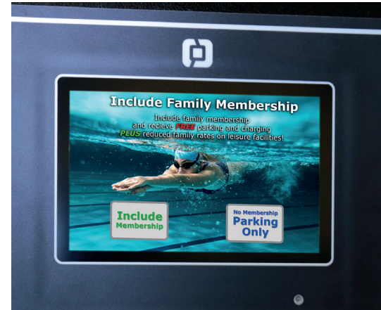
Integration for parking, charging and more