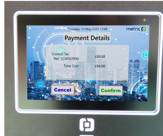
Integration for parking, charging and more