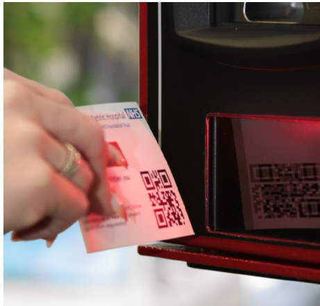
QR/Barcode Scanner for Free or Discounted Tariffs