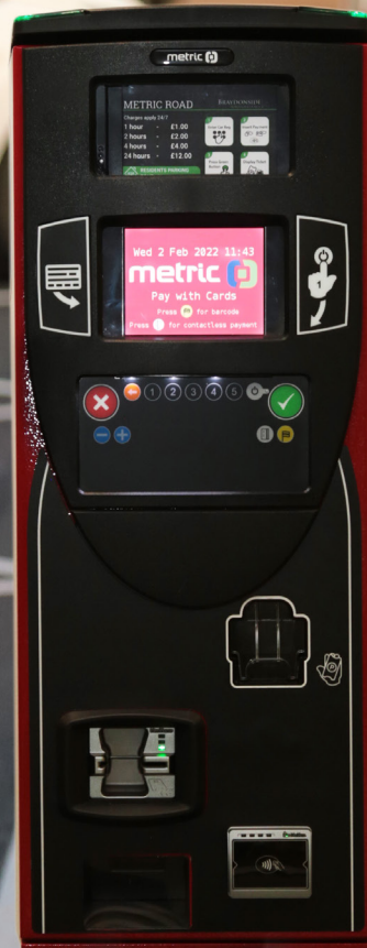
Go cashless with the pedestal mounted Sprite