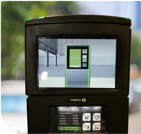
High Definition Advertising Screen