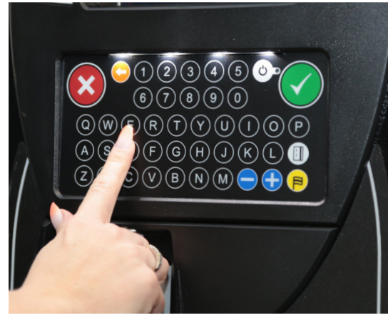
User-friendly Capacitive Keyboard